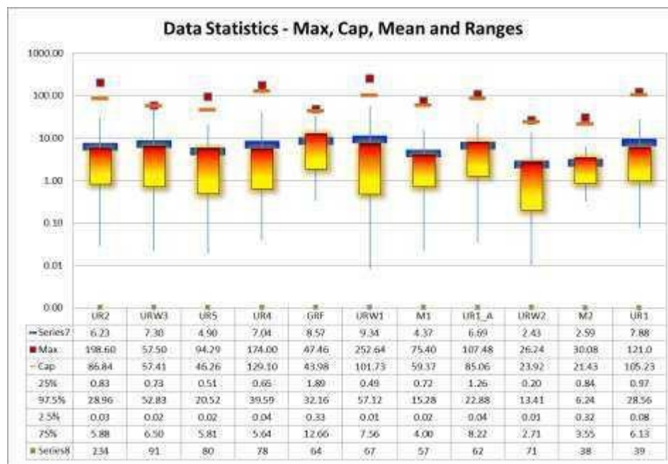
Figure 2 - Box and Whisker Plot for Veins with more than 50 Intercepts

Veins with more than 50 intercepts were assessed for outliers, via histograms log probability plots and metal loss. Uncapped and capped summary statistics are graphically represented in Figure 2. Veins with less than 50 intercepts were considered unreliable representations of the distribution, and the grade cap was selected at the 97.5th percentile which often resulted in only one value being capped.