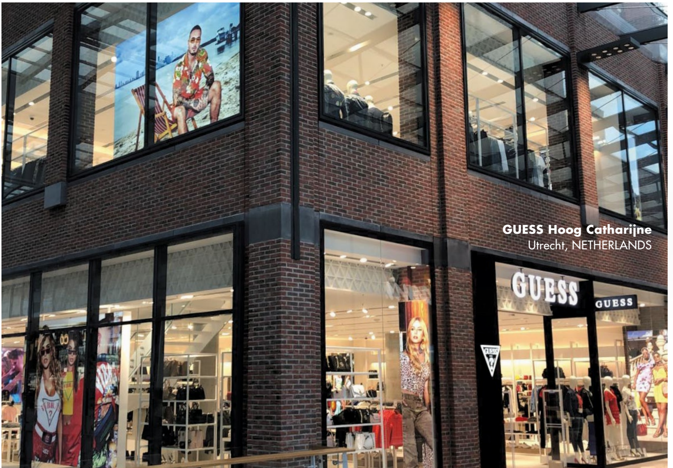
GUESS Hoog Catharijne Utrecht, NETHERLANDS