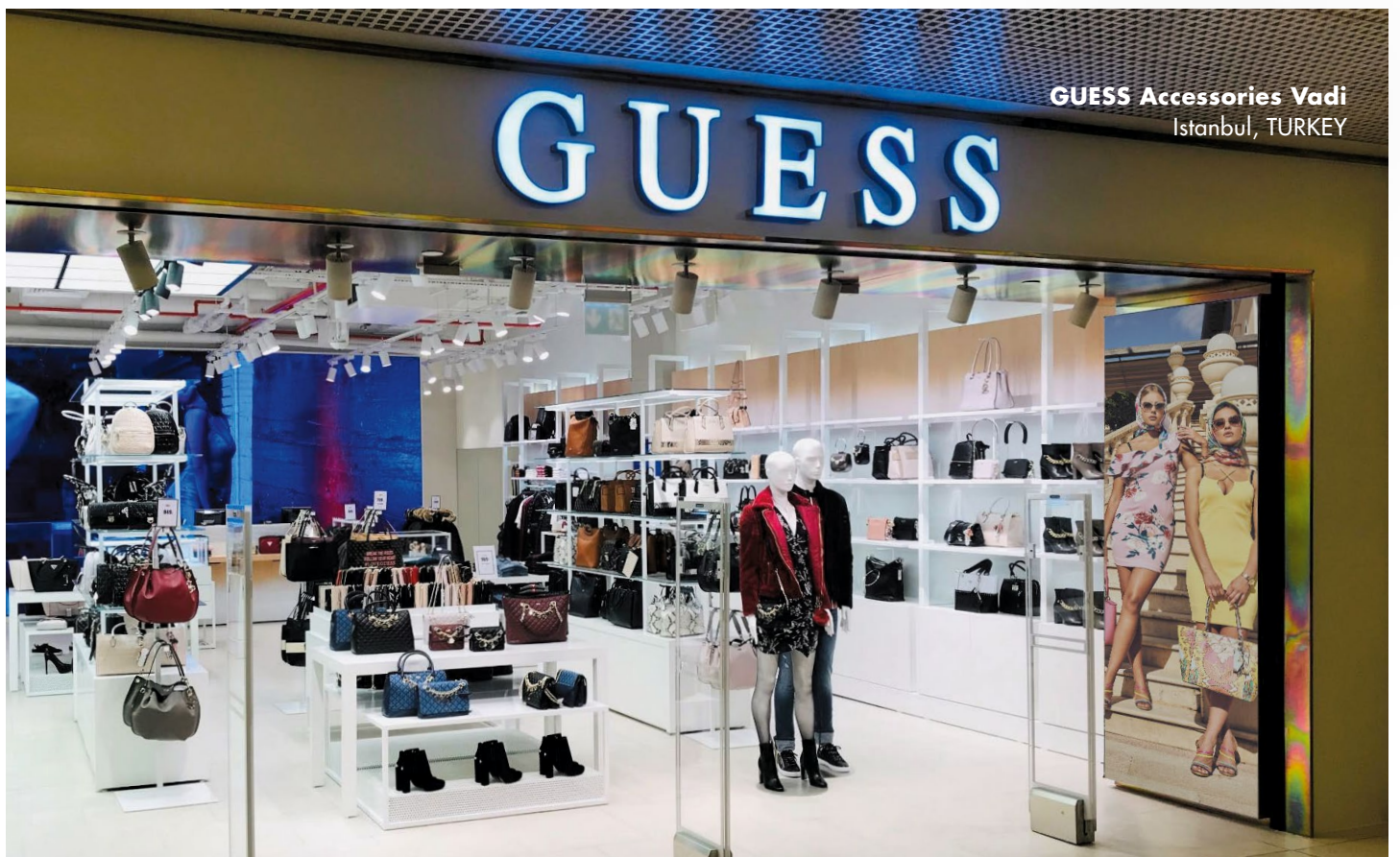
GUESS Accessories Vadi Istanbul, TURKEY