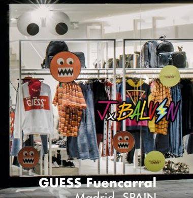
GUESS Fuencarral Madrid, SPAIN