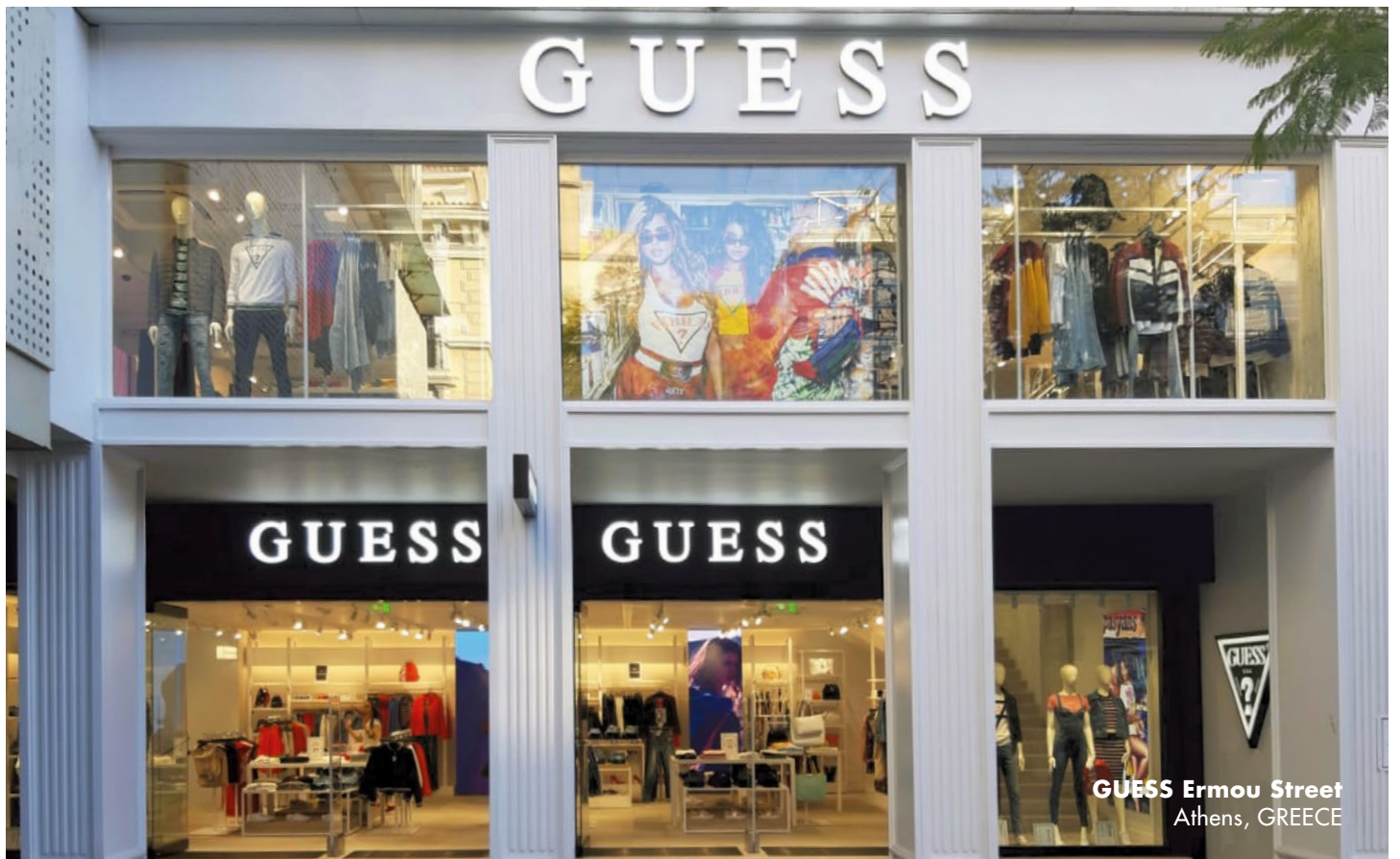
GUESS Ermou Street Athens, GREECE