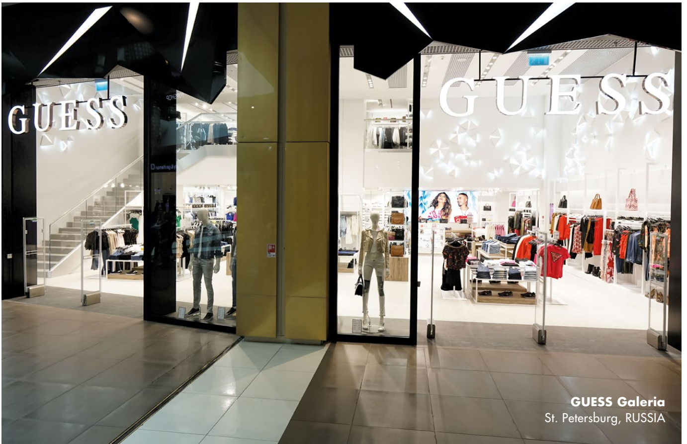
GUESS Galeria St. Petersburg, RUSSIA