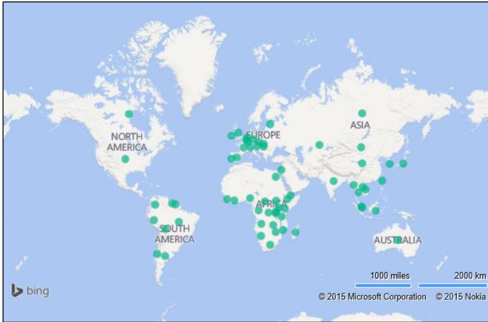
Figure 3: Country-of-Origin Information for CFSP-Compliant Smelters and Refiners

For identified conflict-free smelters for which minerals sourcing information is available from CFSI: