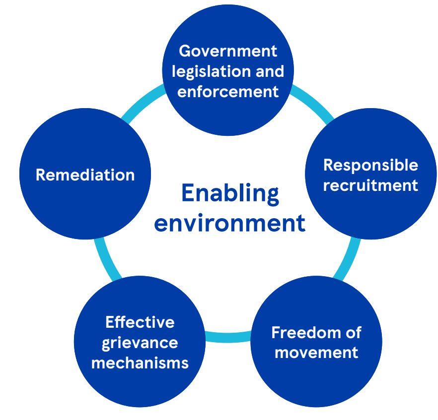
Diagram 1: The five factors

one of the world's largest collaborative platforms for sharing responsible sourcing data on supply chains, on their ethical trade audit standard and guidance, to make sure identification of recruitment fees and costs is fully supported.