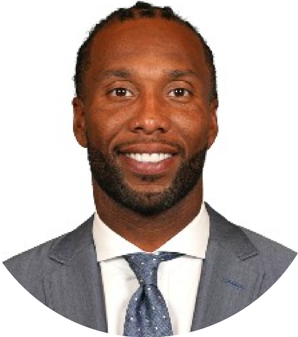
LARRY FITZGERALD, JR.

Professional Athlete, National Football League