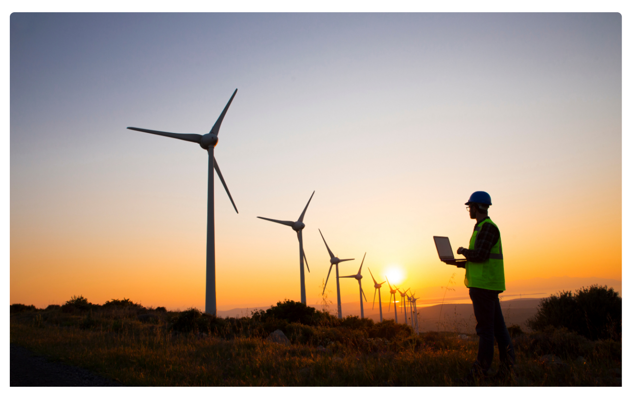
Our commitment to public safety