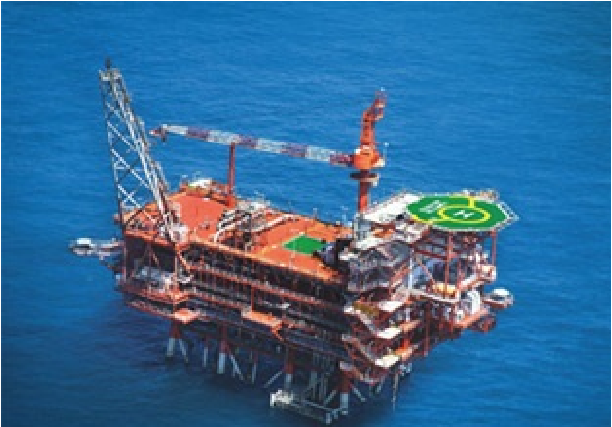
EXPLORATION & PRODUCTION