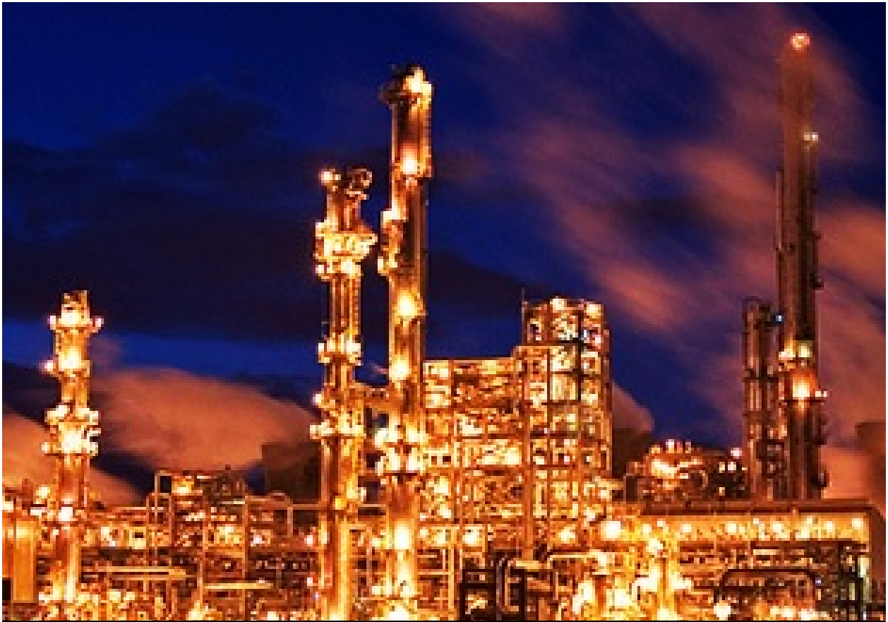
PETROLEUM REFINING & MARKETING