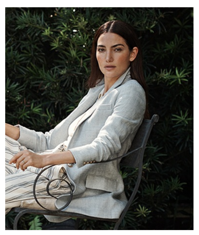
LAUREN RALPH LAUREN