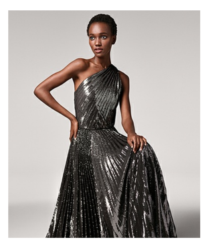
RALPH LAUREN LUXURY