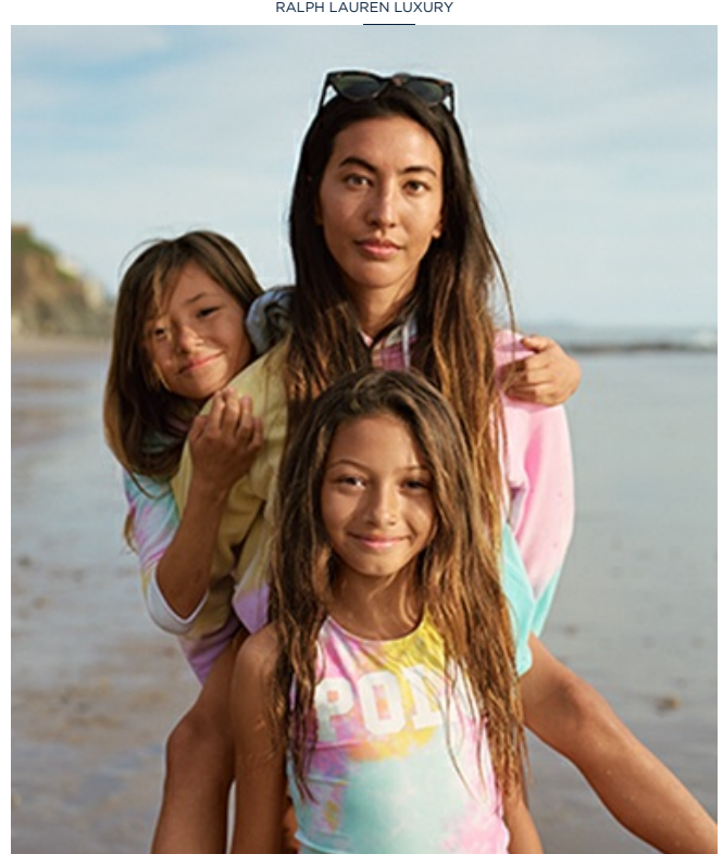
POLO RALPH LAUREN