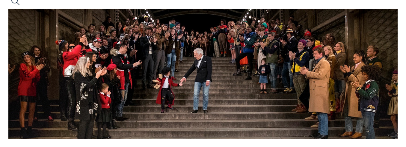
"What I do is about living the best life you can and enjoying the fullness of the life around you. From what you wear to the way you live to the way you love."