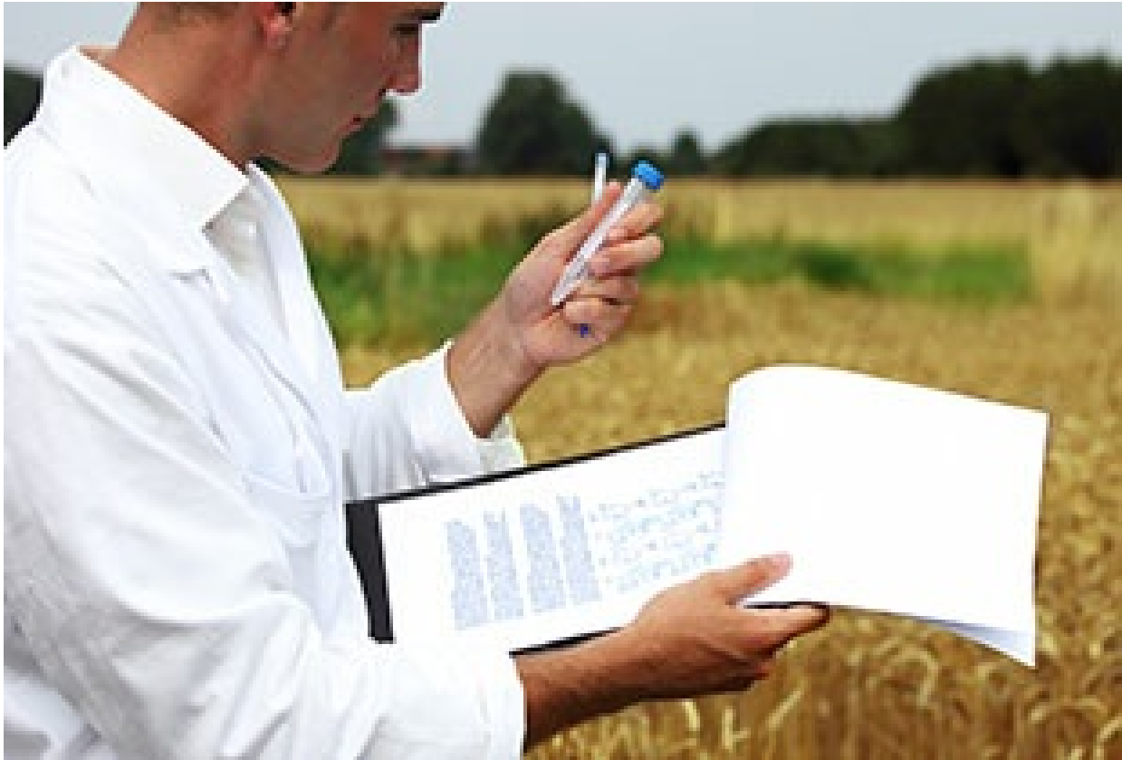
Both for your and your beloved ones' health we periodically inspect our suppliers