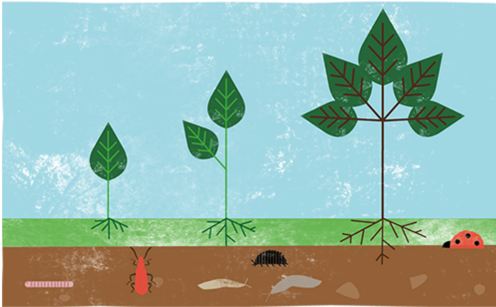
All stakeholders engagement

Our consumer care service does its utmost to answer all questions from consumers , we track the level of complaints but also the consumer care service level to ensure all contacts receive an answer as soon as possible. We have daily discussions with our Customers and measure our service quality level, as our key performance .