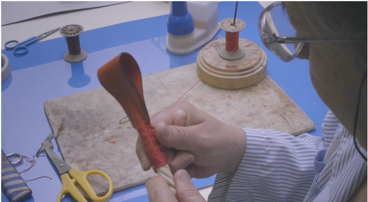
Esat des Micocouliers, Sorède, France

Discover how responsible sourcing takes part in our strategy "All artisans of our sustainable development".