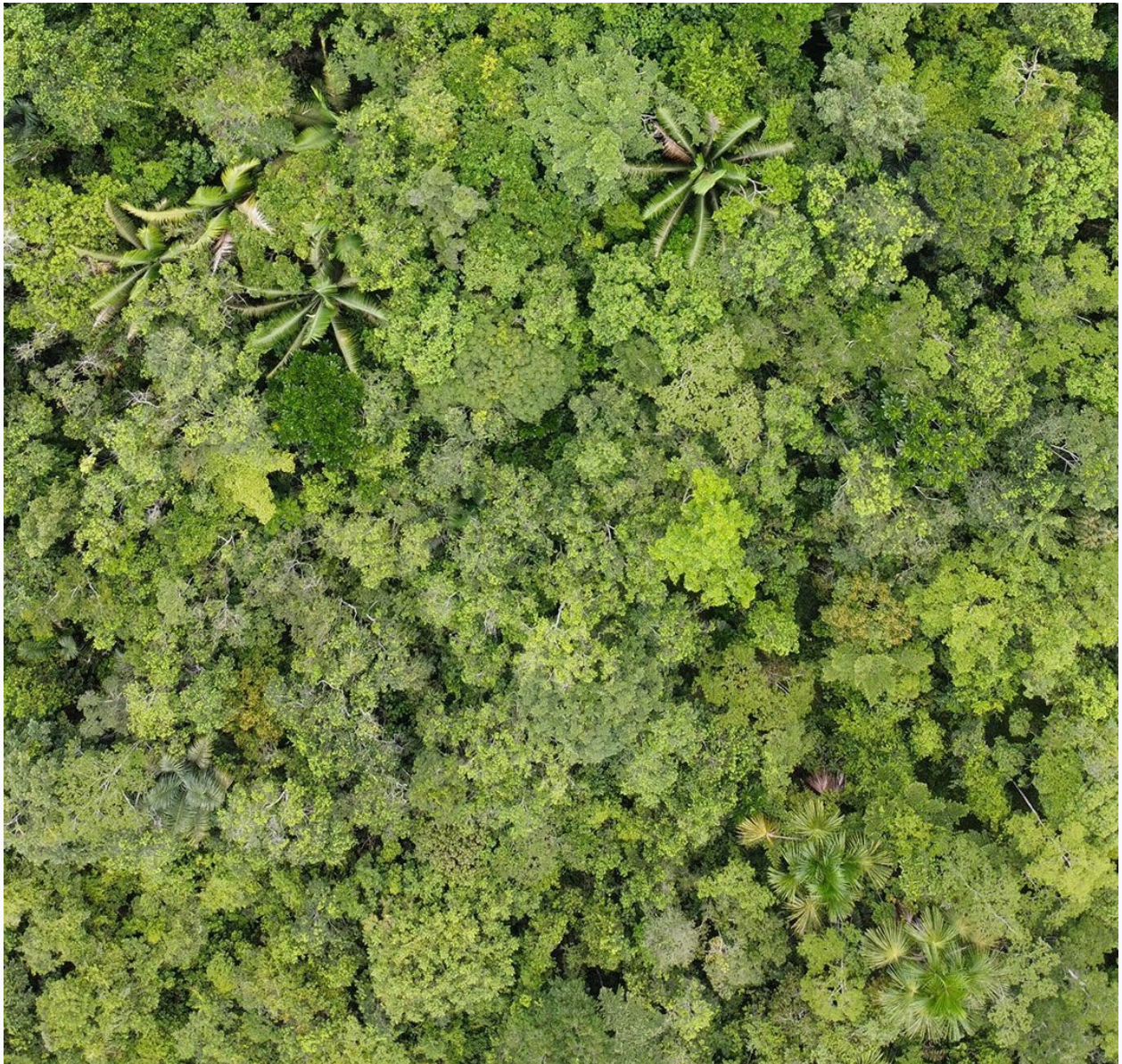
Aerial of forest in Peru.

The company's greenhouse gas emissions improved in 2020, in particular due to the attention paid to choosing suitable materials, the reduction of their weight and seeking out local supplies combined with low-carbon modes of transport. These topics are currently under discussion with our partners to reduce our common footprint.