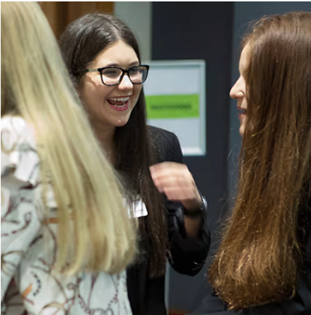
Investing in our people