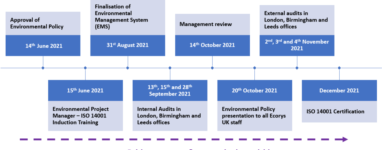
Figure 3: Timeline to obtain ISO14001 certification.